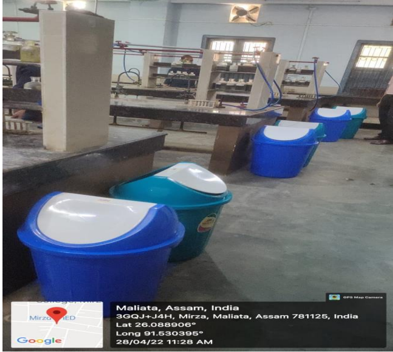
Coloured dustbins for chemical waste