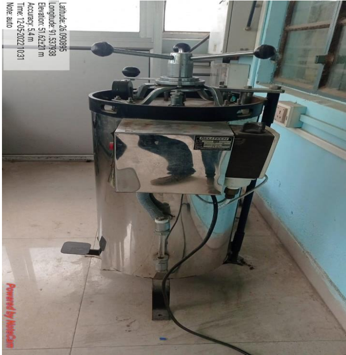
Auto Clove System

Latitude: 26.090895 Longitude: 91.537938 Elevation: 51.6271 m Accuracy: 5.4 m Time: 12-05-2022 10:31 Note: auto